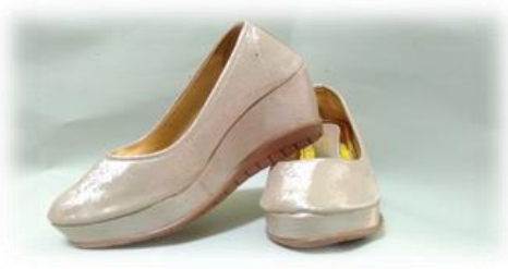
Fig. 4. Wedges.

b) Price : The price of high heels and wedges of SMEs products is Aceng, is Rp. 610.000/kodi for Wedges and Rp. 700.000/kodi for High heels.