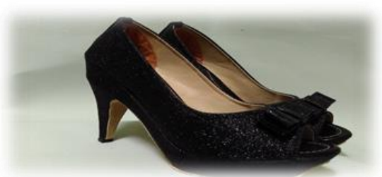
Fig. 3. High heels.

a) Product : The products by SMESs Mr. Aceng as shown in figure 3 and figure 4.