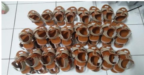
Fig. 5. Final look.

a) Product : Products from this SMES is a sandal slipper with Sabina brand. This product is targeted for women with leg sizes ranging from 31-35 and 37-40.