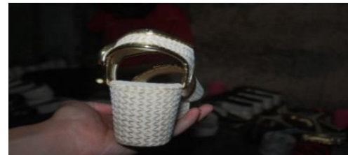
Fig. 2. Product example produced.

a) Product : The resulting product in the form of women's shoes. The resulting product example as seen in figure 2 is as follows: