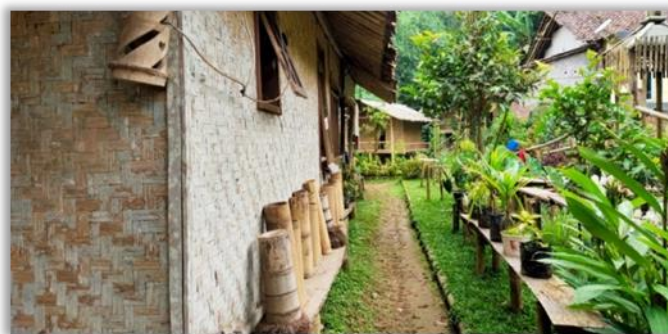
Figure 11. Bamboo Crafts