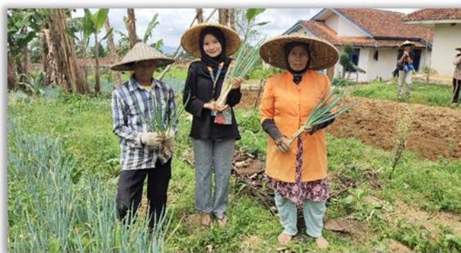
Figure 9. Harvest Garden Products