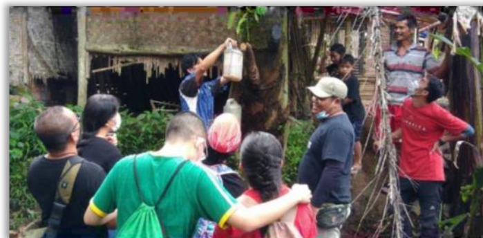
Figure 6. Lahang Water Extraction

opportunity to try to take their own lahang water from trees which have an average height of around 7-10 meters and tourists can directly sip fresh field water from the harvest.