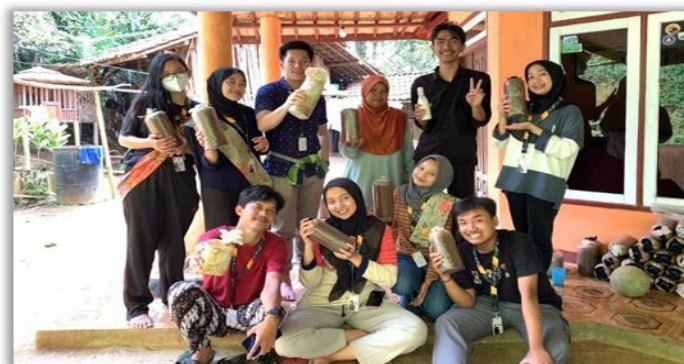
Figure 10. Make a growing medium for straw mushrooms

mushroom cultivation in tourism activities in Kampung Lahang. Ready-to-harvest oyster mushrooms can also be used as an ingredient for cooking along with plantation crops.