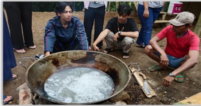
Figure 7. Making Palm Sugar (Lahang Sugar)