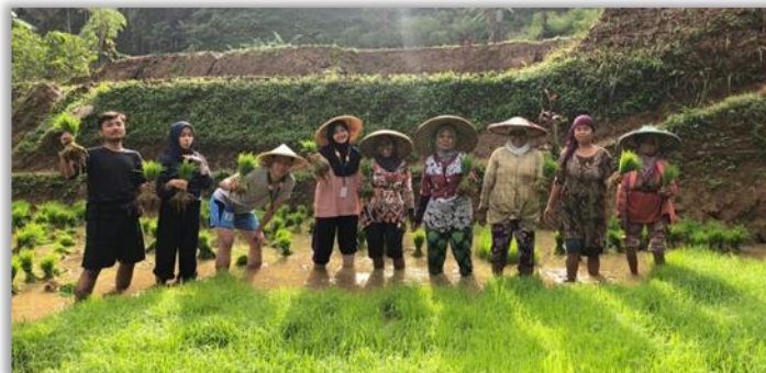
Figure 8. Planting rice in rice fields

view of the expanse of rice fields in the Kampung Lahang area is also an added value for the participants who take part in this activity. In each of these activities, tourists will be given rice seeds which will be planted according to the directions from the guide.