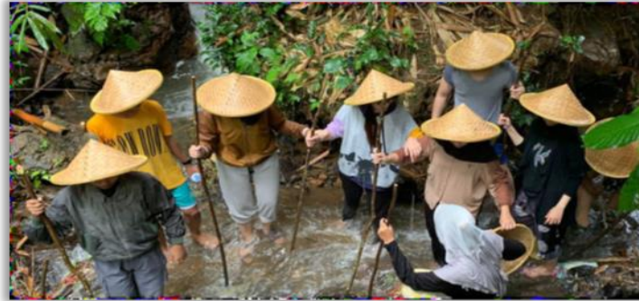
Figure 5. Trekking (Mapay Wahangan)

which tends to be difficult to reach and is in the middle of the forest but the manager provides trekking poles.