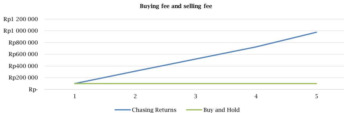
Figure 3. Comparison of total buying fee and selling fee

The chasing returns strategy spends a very large amount only for fees (selling and buying), which is Rp. 976,438, this amount is even greater than the total profit obtained from the investment returns of chasing returns, which is Rp. 872,654 (Rp. 10,872,654 - Rp. 10,000,000). Meanwhile, the buy-and-hold fee only issues a one-time fee for five periods, this fee is used to buy stock mutual funds at the beginning of the period, the nominal amount is much smaller when compared to the chasing returns fee, which is Rp. 100,000.